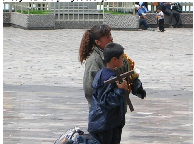
HE HAS COME TO SET THE CAPTIVES FREE! (ISAIAH 61:1)